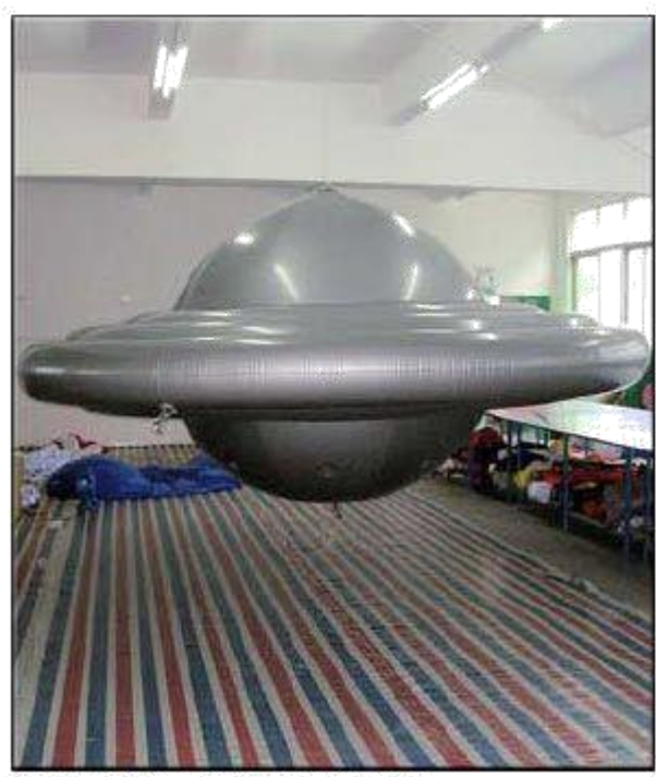
Giant UFO Balloon 6 Meters Wide! $499

No joke. The cotton rope broke even though we lowered it to 20ft off the ground. We had a Bud beer banner on the bottom. It was at the 4th of July event next to the dog park. It was a $400 balloon that took 5 full tanks of helium @ $80 per tank. I was not happy that it cost me that much to fill. So I'm not too sad to have seen it get away.... CodertAZ