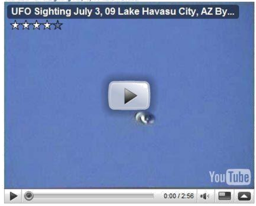
YouTube - Lake Havasu UFO from Hi Resolution stills